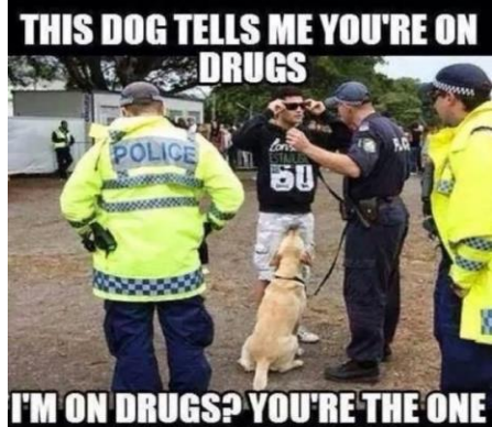
TALKING TO A DOG!